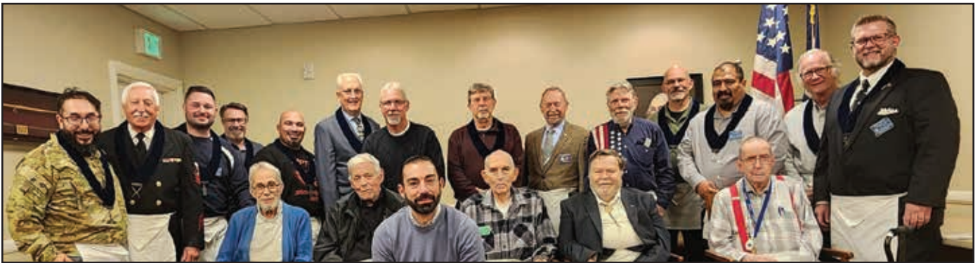
Above: Centennial Lodge held a meeting