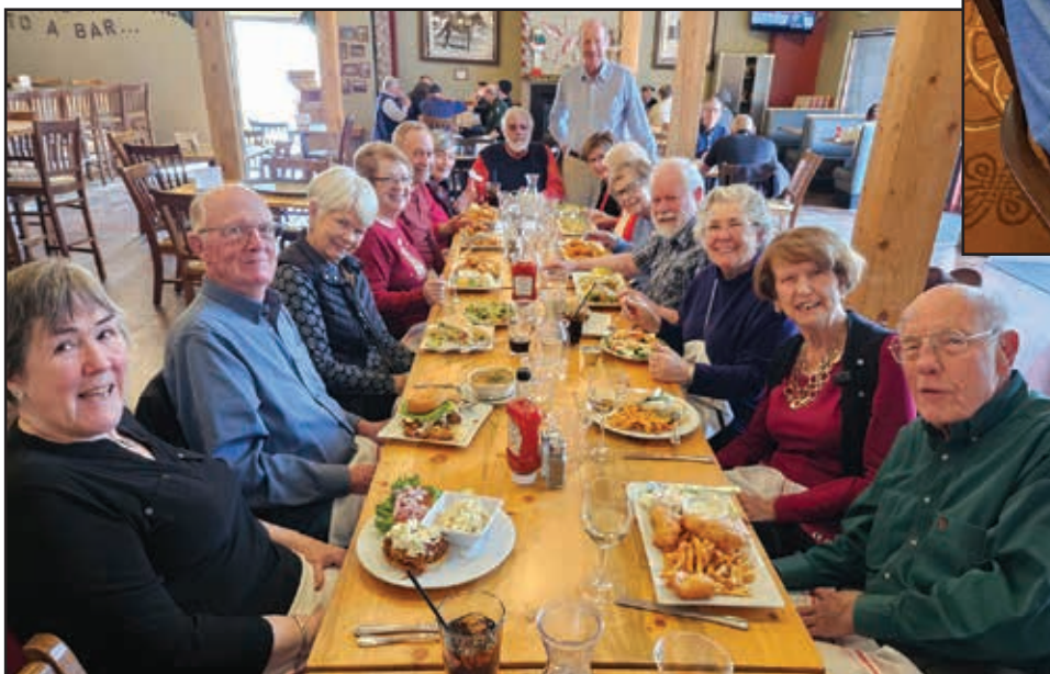
Left: Residents who live in the Star Vista Village went out to eat lunch.