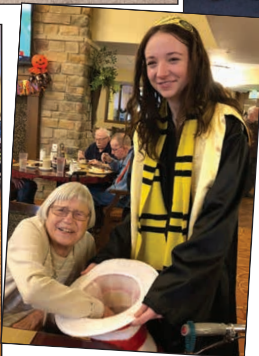
On Halloween, the Masonic youth, dressed in costume, handed out candy to residents, who also wore costumes for the holiday.