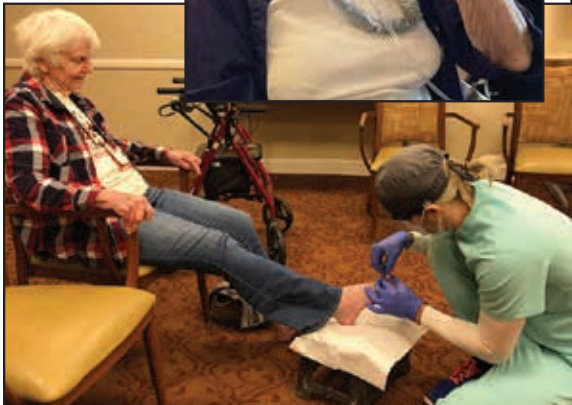
Left: Getting your toe nails clipped is a favorite activity for residents.