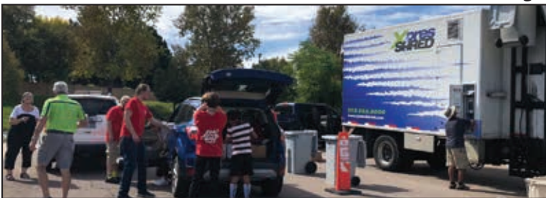
Left: Colorado DeMolay had their fall Shred-a-Thon — collecting sensitive paper documents that residents, staff or Masonic members wished to have shredded.

W hat would the Board like to see from you? Become a Delegate. Ask your group to hold a meeting at the Center. Adopt a resident. Help educate our sisters and brothers about what we do and explain how they can help. Financial donations are always welcomed. They are used for the purposes you designate, (resident programs,