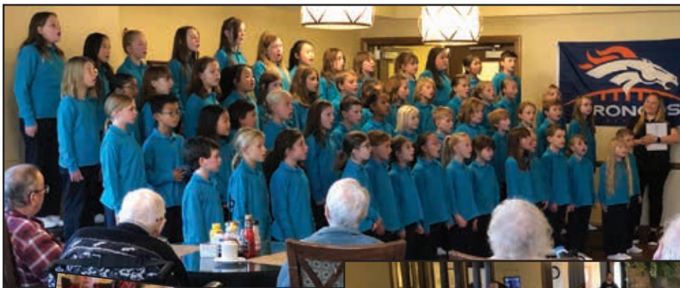
Left: The Colorado Childrens Chorale performed a Winter Concert at ESMRC. It was well attended by residents (below).