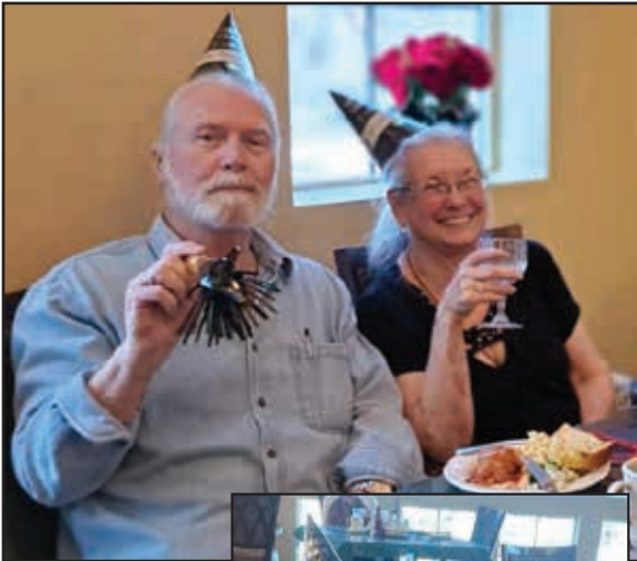
Above and right: Making noise for the New Year!