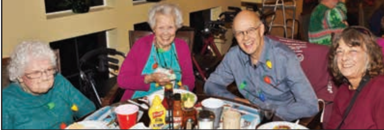
Left and below: Photos from the Family Christmas Party