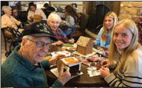
Left and below: Volunteers from the Colorado Rapids Girls soccer team came and decorated gingerbread houses with residents. The houses were donated by Sams Cub (right).