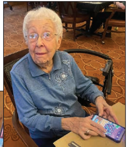
Above: You want me to do what with my cell phone?